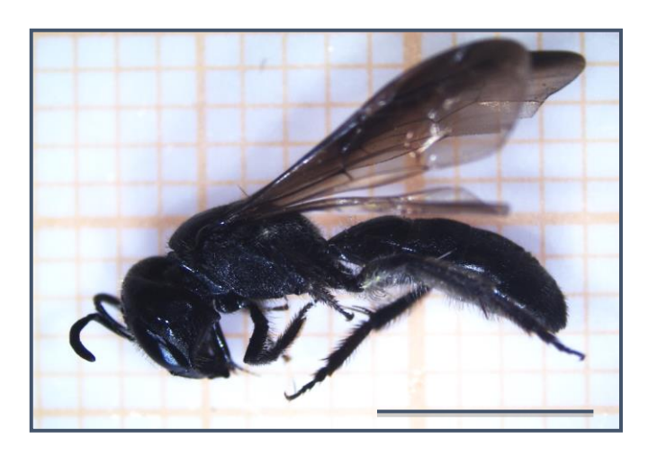
Fig. 2. Lasioglossum nyctere bee. Bar represents 1 cm.

Following the review of the reports of pollinators of the genus Cypripedium , information was collated from 18 different authors report the species they studied, as well as the pollinator and, in most cases, identified the gender of these (see table 1). According to the observations made, the presence of visitors was influenced by sunlight, from 10:00 am to 3:00 p.m., was the time when the highest activity was observed, approximately 10 floral visitors. It was noted, on subsequent visits, that on cloudy days the presence of floral visitors was null. During the fieldwork conducted as part of this study, two bees of the genus Lasioglossum (Halictidae) were found within flowers of C. irapeanum . The bees belonged to the species Lasioglossum ( Eickwortia ) nyctere Vachal (fig. 2). These individuals were found within the flowers of C. irapeanum , and one had remains of something that looks like pollen on its thorax (fig. 3, D).