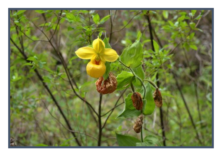
Fig. 1. Flower and fruits of Cypripedium irapeanum in its natural habitat.

Transversal Neovolcanic Axis: Nayarit, Jalisco, Michoacán, Guerrero, Querétaro, Estado de México, Morelos, Puebla, Veracruz and Chiapas (Pérez-García & Mó-Mó, 2014). Despite the wide distribution of this species in Mexico, its populations suffer from various threats such as illegal extraction, fire and land use change, among others.